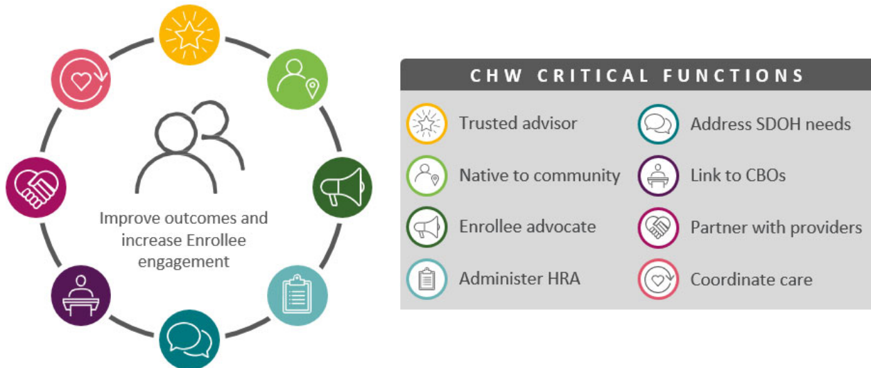
Figure I.A-2 Community Health Worker Critical Functions

As another key component of our care management strategy, Humana is enhancing our Kentucky Community Health Worker (CHW) program, which is designed to bridge cultural and linguistic barriers, expand access to coverage and care, and improve health outcomes.