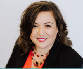
Behavioral Health Director