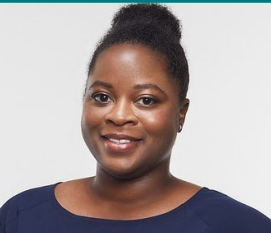
Population Health Management Director