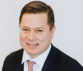
Chief Executive Officer

Humana’s organizational structure is comprised of our established local Kentucky-based market resources, supported by our local executive team, and overseen by our national leadership , bringing together best practices, infrastructure, and feedback from multiple sources (e.g., providers, Enrollees, associates, Subcontractors) that ensure the achievement of programmatic goals, enable the delivery of high quality care to improve health outcomes, and allow our local structure to respond quickly to emerging Enrollee and provider needs. We base our organizational structure upon our more than 40 years of experience from multiple lines of business, industry best practices, organizational values, Commonwealth and federal regulations, DMS Contract requirements, and national healthcare agency guidelines. Through our aligned corporate and local organizational structures, Humana’s Kentucky Medicaid MCO will combine the breadth and scale of Humana’s national experience with our strong, long-standing local presence in Kentucky.