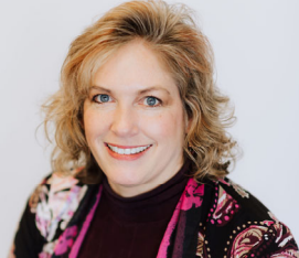
Chief Operating Officer